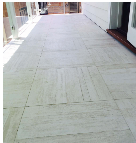
INEX>FLOOR for Tiled Decks and Balconies

INEX>FLOOR is priced for value for the construction industry and competes strongly against all comparable products. For pricing, refer to UBIQ's website for your nearest stockist.