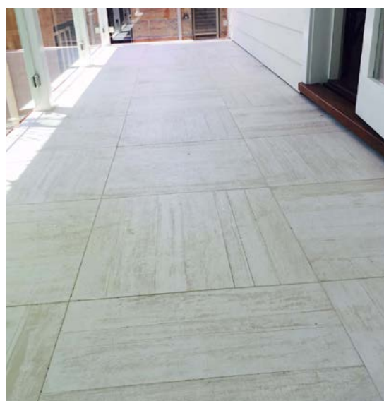
INEX>FLOOR for Tiled Decks and Balconies

INEX>FLOOR is priced for value for the construction industry and competes strongly against all comparable products. For pricing, refer to UBIQ's website for your nearest stockist.