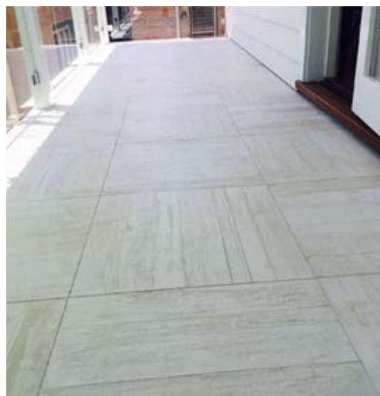
INEX>FLOOR for Tiled Decks and Balconies

INEX>FLOOR is priced for value for the construction industry and competes strongly against all comparable products. For pricing, refer to UBIQ's website for your nearest stockist.